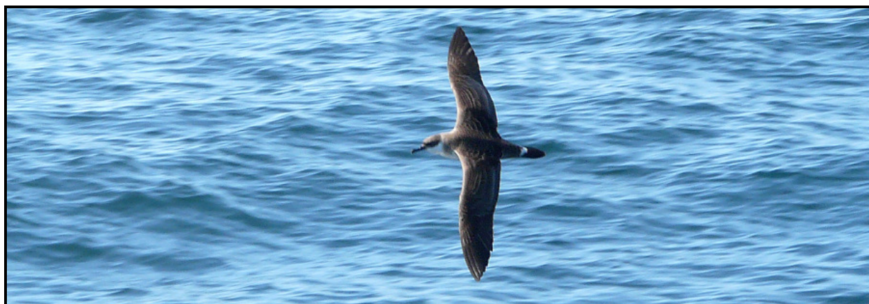
Great Shearwater out of Westport, Brier Island, NS on Sep. 5, 2010