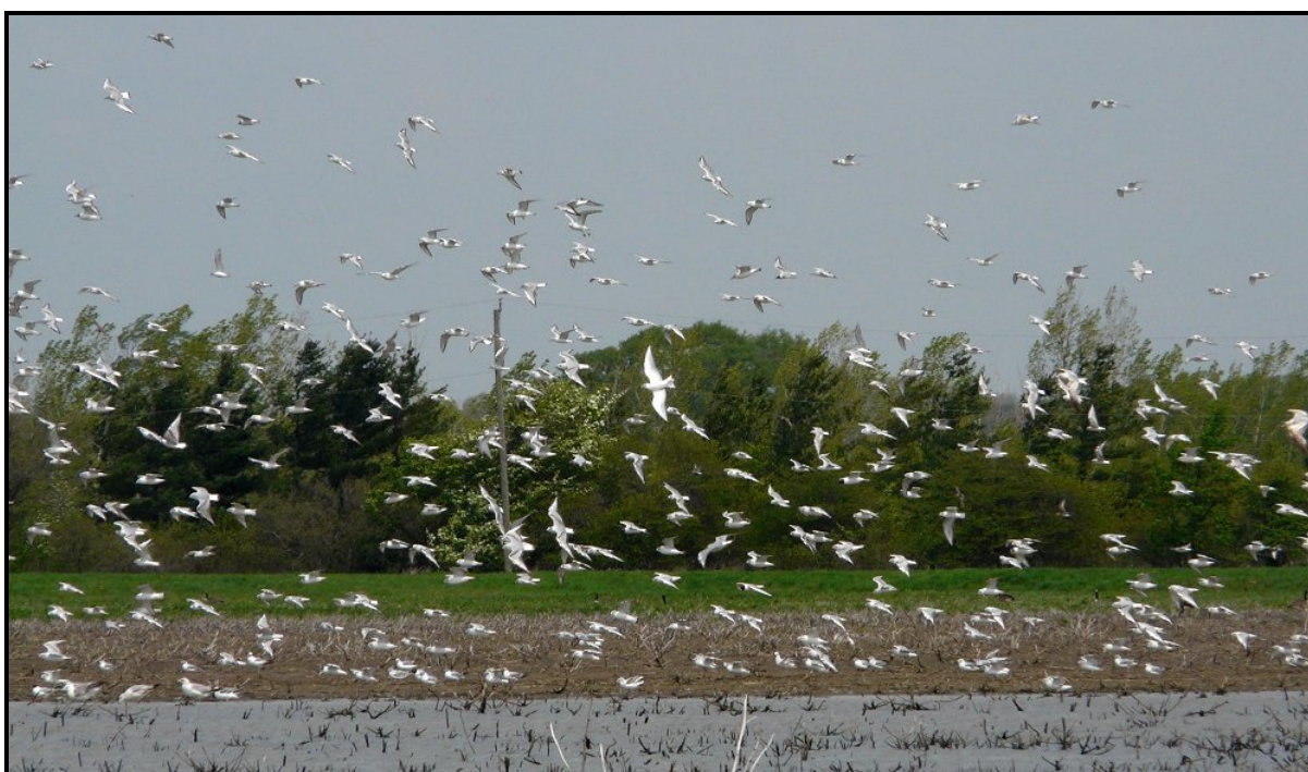
Gulls (mostly Bonaparte's) at Hillman Marsh, Wheatley, ON – May 17, 2008