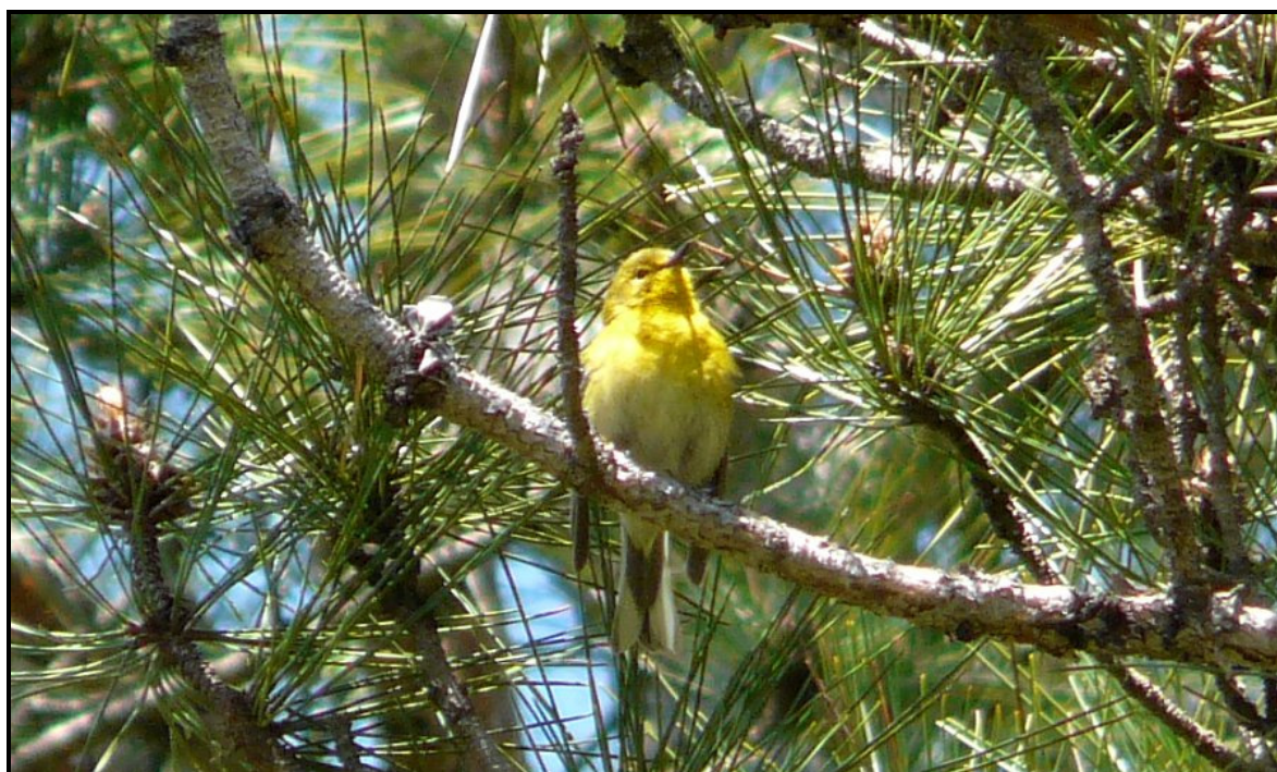
Pine Warbler in the Larose Forest, E of Limoges, ON on May 18, 2009