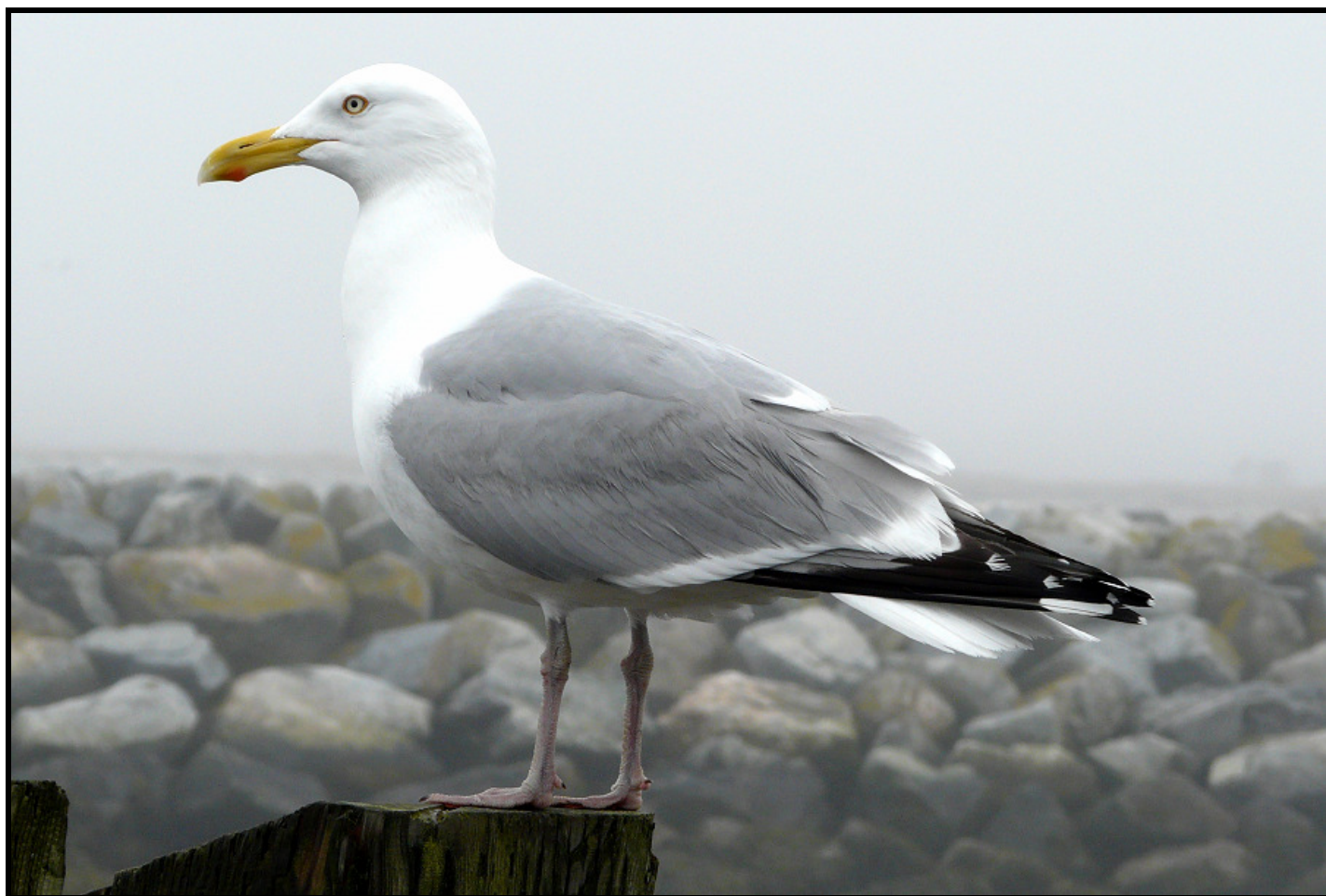
Herring Gull at Daniel's Head, Cape Sable Island, NS on Apr. 29, 2011