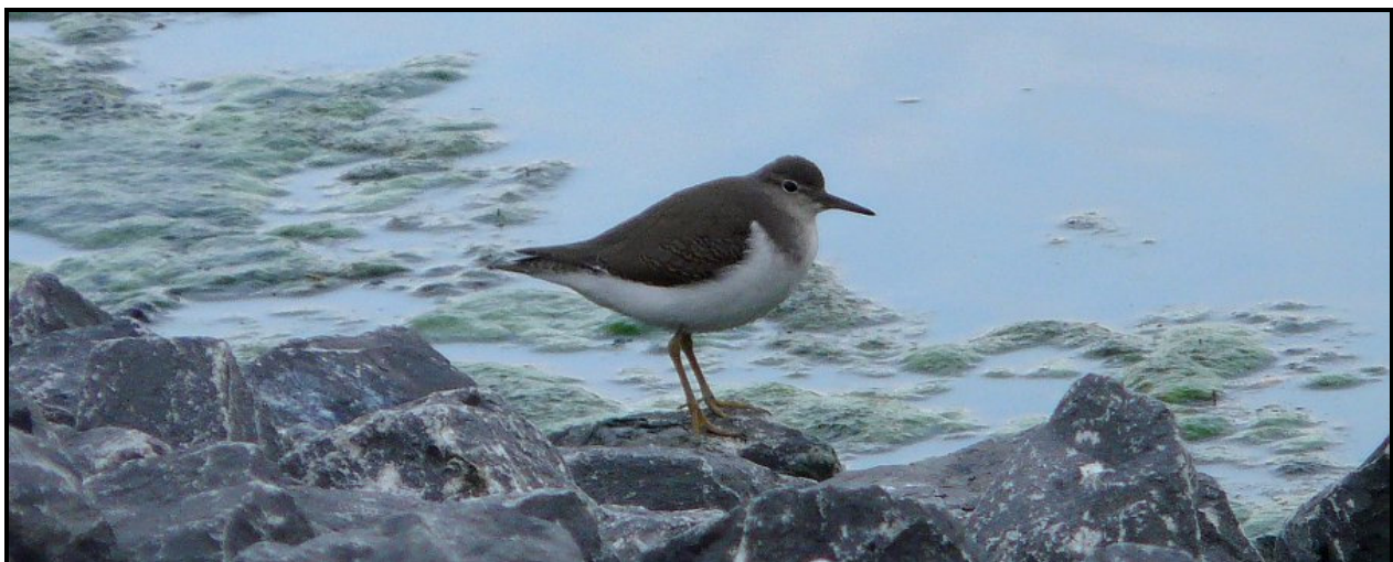
Spotted Sandpiper at the Casselman Sewage Lagoons, Casselman, ON – Aug. 15, 2008