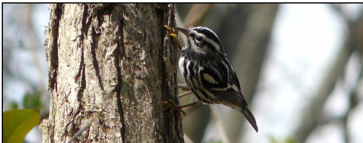
Black-and-White Warbler at Britannia Conservation Area, Ottawa, ON on May 7, 2011