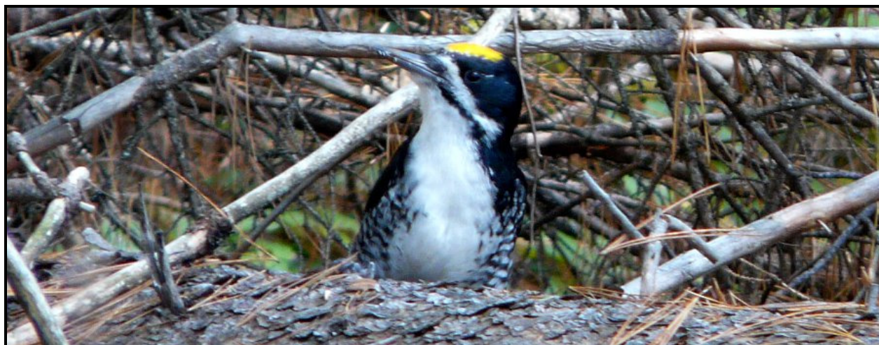
Black-backed Woodpecker (male) on the Spruce Bog Trail, Algonquin Provincial Park, ON on Oct. 11, 2010