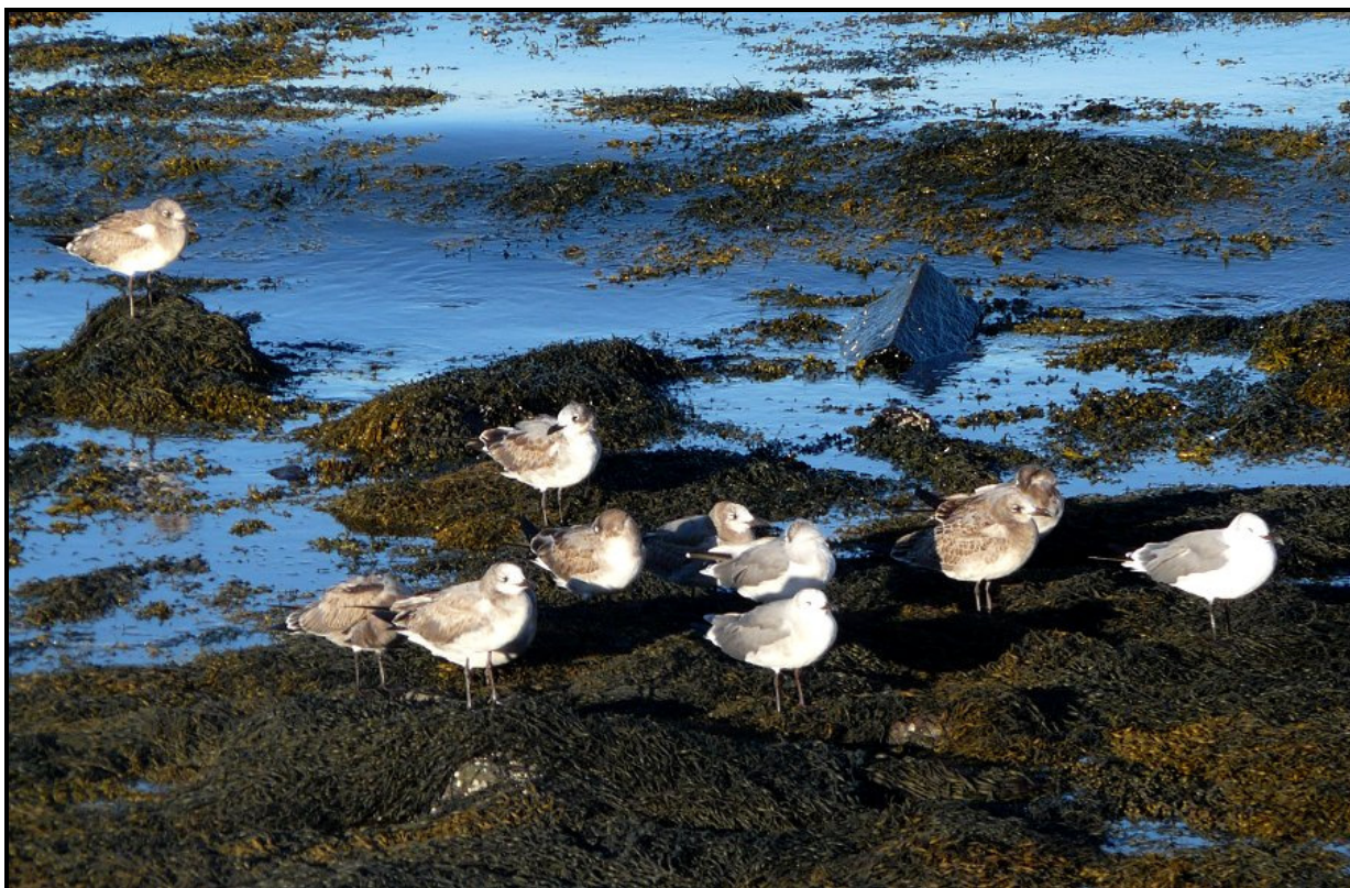
Part of an Earl-blown flock of Laughing Gulls at Westport, Brier Island, NS on Sep. 5, 2010

Do I apologize to those who live in Ontario for putting a bird on the cover that you’ve all likely seen anyway; or to those in the rest of Canada who might want one of their own rare birds there? Obviously, both and neither. Some will enjoy it either way, some will complain. Human nature. I expect many lists were augmented by virtue of a visit to Picton to see this very cooperative Black-bellied Whistling-Duck in the months of July and August 2010. This picture was taken by your compiler on July 15. The other bird photos in this issue were taken by the compiler unless otherwise noted.