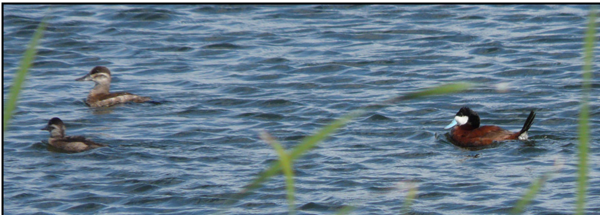
Ruddy Ducks at the Embrun Sewage Lagoons near Embrun, ON on Aug. 17, 2008